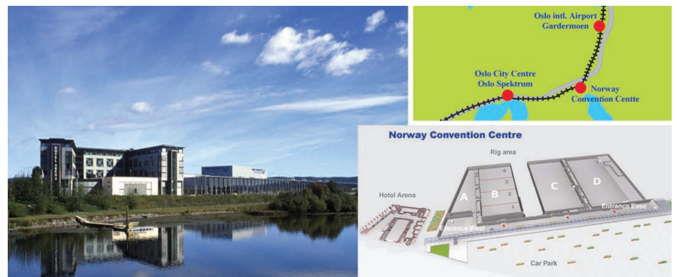
Figure 2 The venue for the 33rd IGC, the Norway Convention Centre, which is located midway between Oslo City Centre and the Gardermoen International Airport, roughly 15 min. train ride from either side. The lower right inset shows the centre outline. Hall B will be used for the "Themes of the Day" and plenary lectures. GeoExpo 2008 and the poster presentations will be located in Hall C, whereas additional lecture halls will be built inside Hall D.