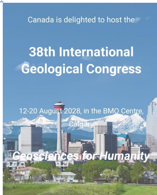
38 th IGC in 2028 Calgary, Canada.

https://calgary.ctvnews.ca/calgary-to-host-olympics-of-geology-event-in-2028-expected-to-draw-up-to-10-000-geoscientists-1.7061204