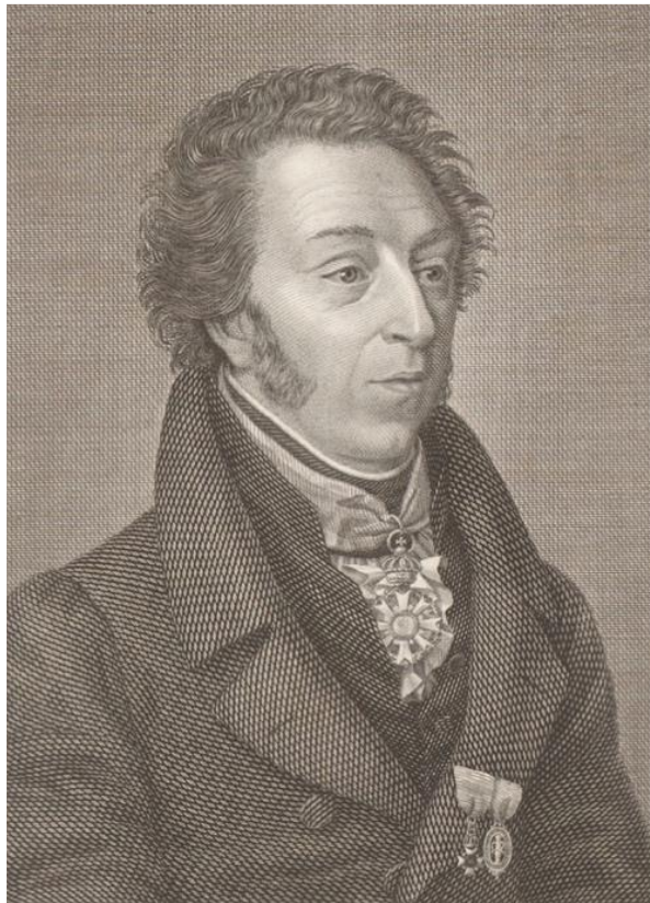
Figure 3: Portrait of Karl Casar von Leonhard (Collection of the Rijksmuseum, Amsterdam; Wikipedia:public domain)

Please open the link to know more: http://www.inhigeo.com/anniversaries.html