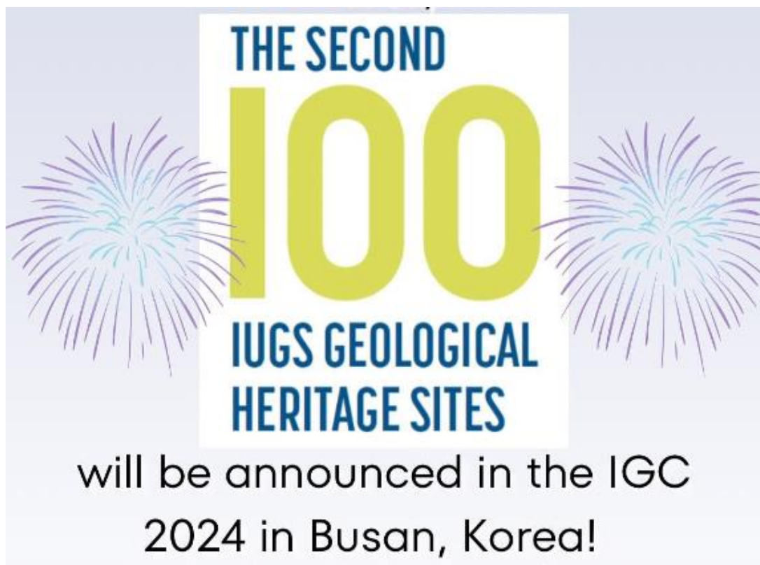
Figure 7. Announcement of 2 nd 100 IUGS Geological Heritage sites.

The 2 nd IUGS Geological Heritage Sites shall be announced at the 37 th IGC in Busan, Korea.