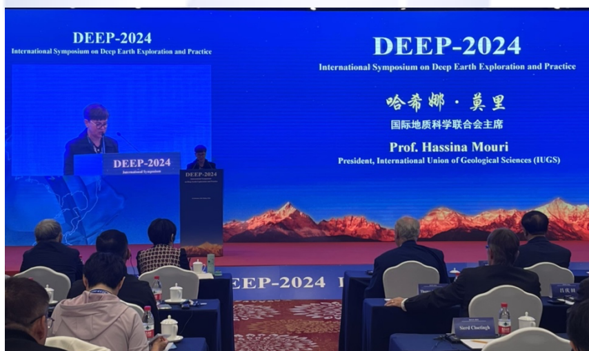
Prof. Mouri giving an opening address at DEEP 2024.

I also delivered keynote addresses at the opening ceremonies of the International Symposium on Deep Earth Exploration and Practice (DEEP-2024) in Beijing and the event organized by the International Lithosphere Program (ILP), one of the successful long-term joint initiatives between IUGS and the International Union of Geodesy and Geophysics (IUGG).