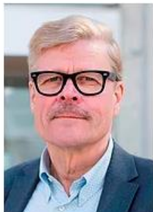
Pekka Nurmi (Finland)