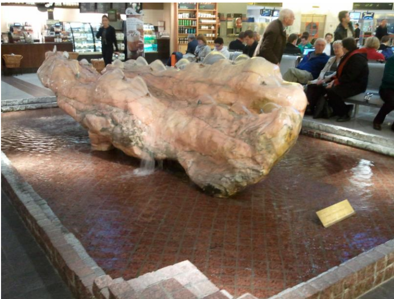
Fig. 6 - Estremoz marble at Vienna airport

For more information: http://globalheritagestone.com/igcp-637/igcp-achievements/