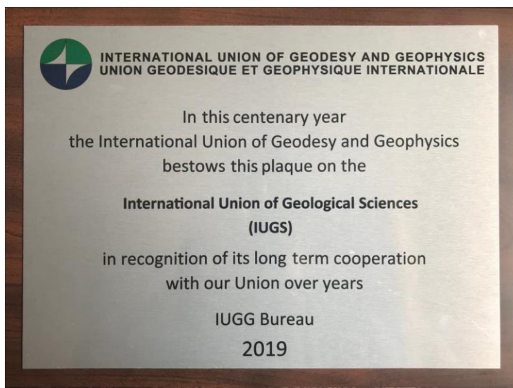
Fig. 2 - The Commemorative Plaque